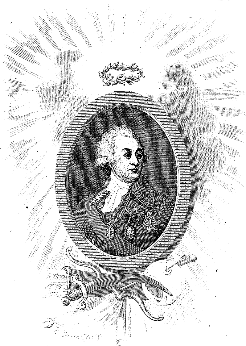
GREGORY ALEXANDROWITZ POTESKIN. Favorite of Catherine II.

London, Published Oct. 3. 1793. by G. Carver, Bookseller, No. 132. Strand.