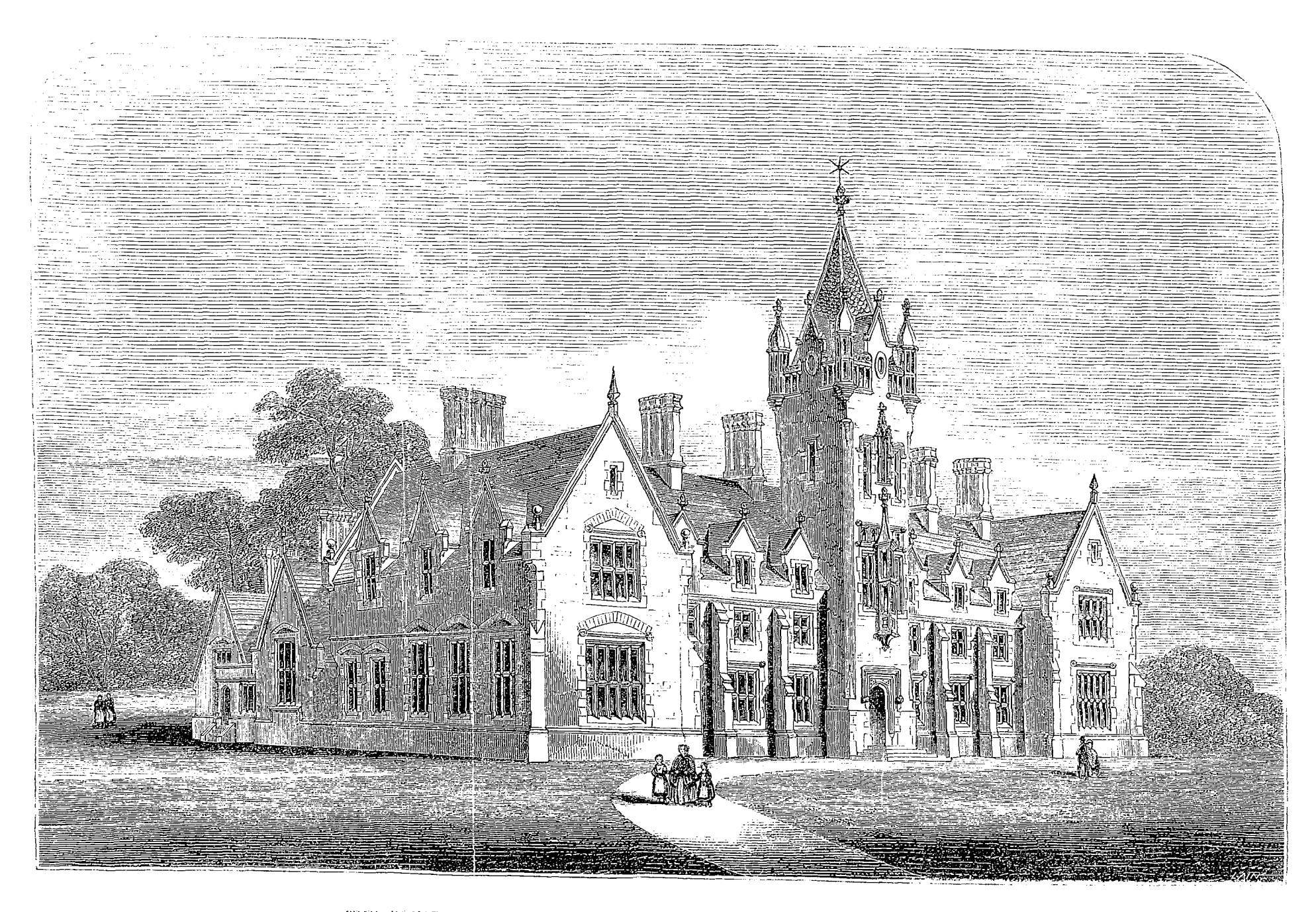
THE ROYAL FREEMASONS' SCHOOL FOR FEMALE CHILDREN, WANDSWORTH.