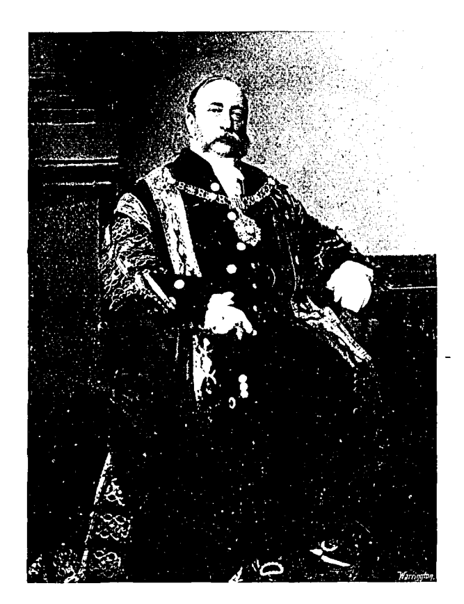
SIR POLYDORE DE KEYSER, LORD MAYOR 1887-8, INITIATED IN THE LODGE OF EMULATION IN 1862.

In January, 1834, the Audit Committee reported that there was a balance due to the Treasurer of £39 5s. 3d., and at