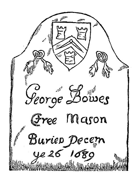
A PRE-HISTORIC BROTHER.